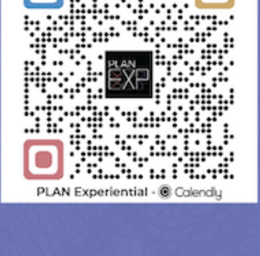
PLAN Experiential - @ Colendy