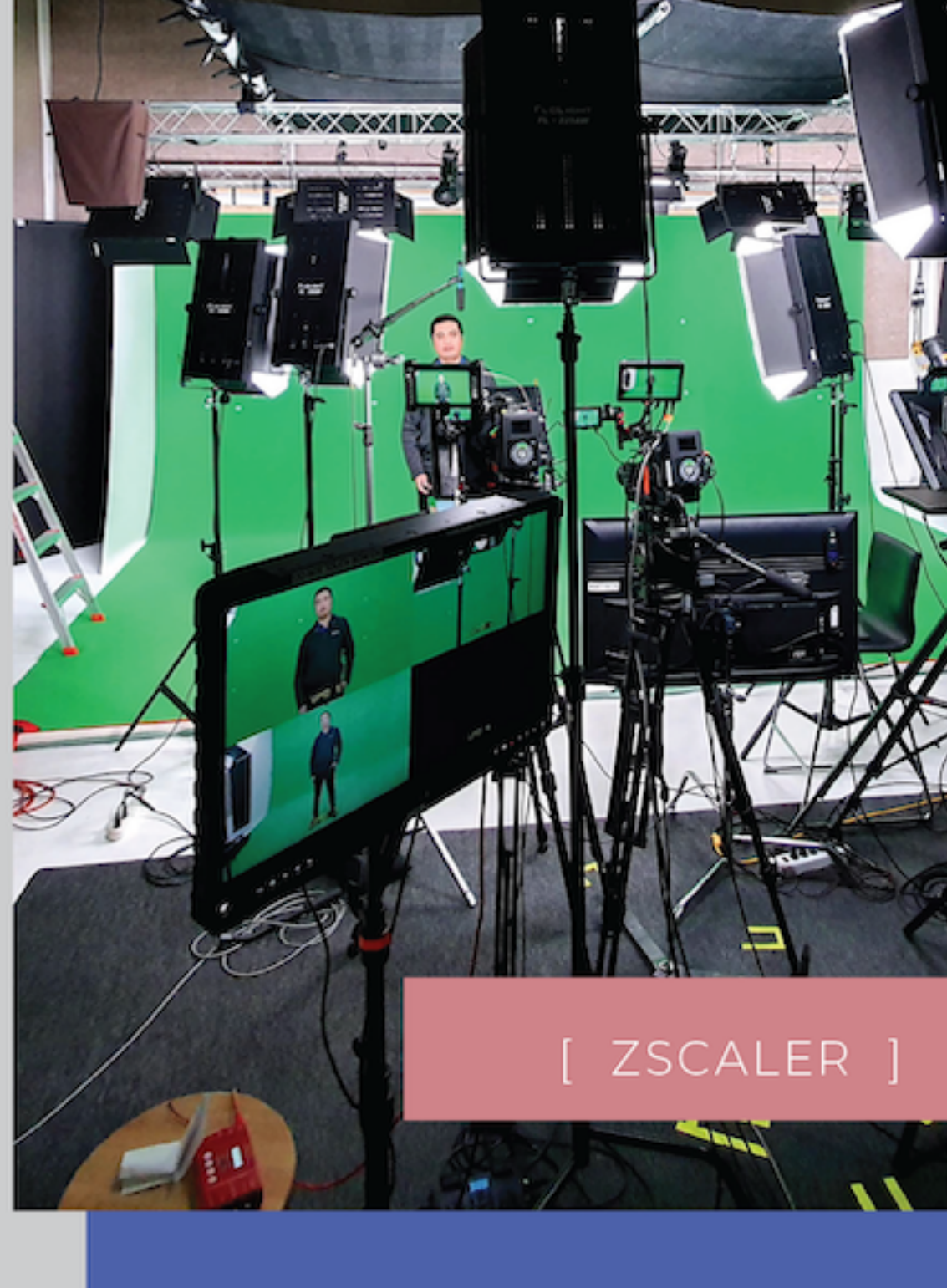
[ ZSCALER ]