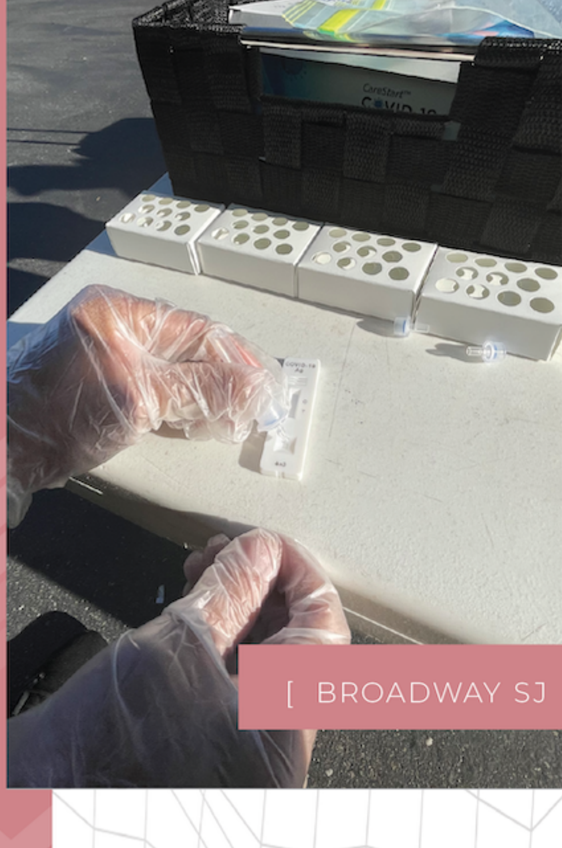
[ BROADWAY SJ ]