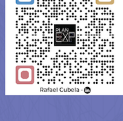
Rafael Cubela - @