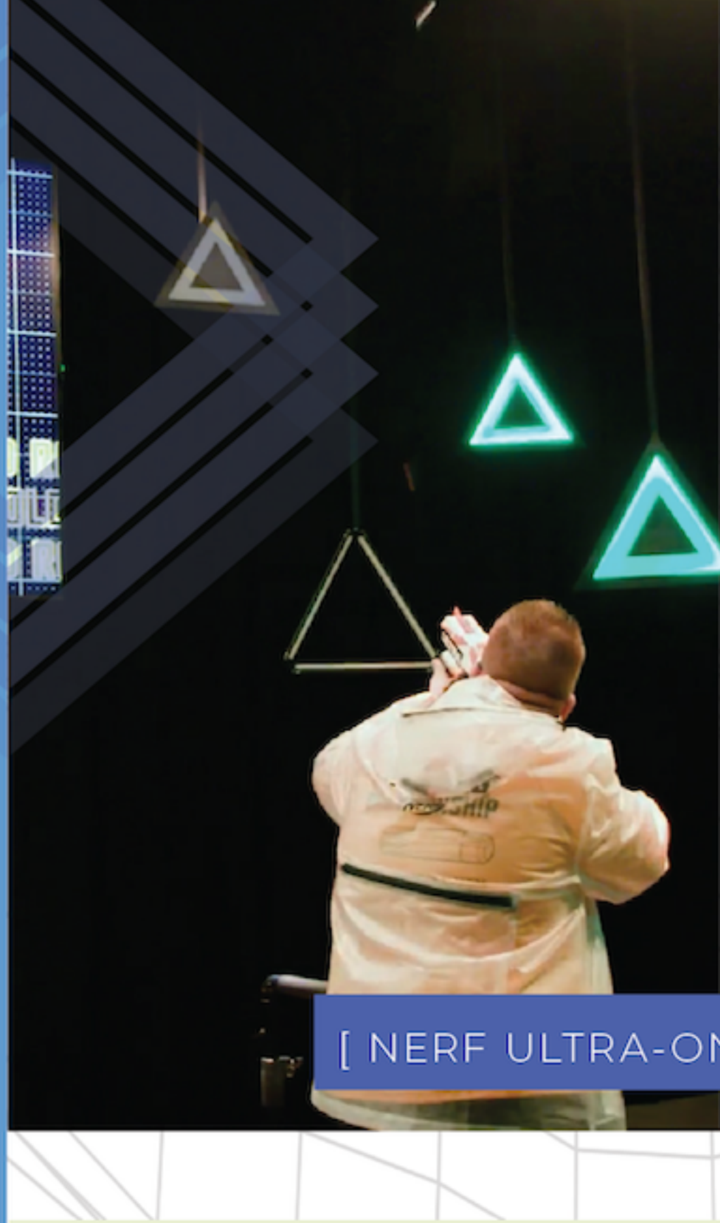
[ NERF ULTRA-ONE ]